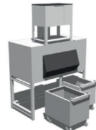
MAR 126+SIS1350 (sold separately)