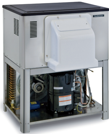
ABS Ice Chute Cover: sold separately.