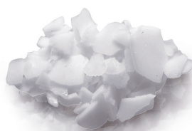
Residual water content 2%

Ice scales are the coldest form of ice. Formed at -6° to -12°Celsius, they are very dry, containing less than 2% residual water. Scales look like fragments of glass, have an irregular shape and a thickness that can be adjusted at 1 or 2 mm.