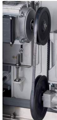
Pulleys & belt system allows to modify ice thickness